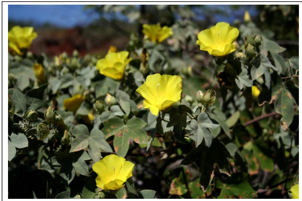
Figure 2. Blossoms of the ma'ō or ma'oma'ō (Photo No. KPAC_881)

...Hi'iaka then departed Pōhākea, descending to the plain of Keahumoa [between Waipi'o and Honouliuli]. It was at this place that she saw several women gathering the blossoms of the ma'ō [Gossypium tomentosum, an endemic yellow-flowered hibiscus that grows on the dryland plains; Figure 2] with which to string garlands for themselves. She then saw them sit down and begin to string and complete the garlands for themselves, so that they could adorn their necks. These women adorned themselves in the ma'ō garlands and were really quite beautiful. Hi'iaka then felt her own neck, for she was without a lei. Hi'iaka then thought about what to say to the women regarding the garlands with which they had adorned themselves. She then thought within herself, I am going to ask them for a lei that they had been burdened with making. If they have aloha for me, then there is no kindness which they shall not have, but if they deny me, so it will be.