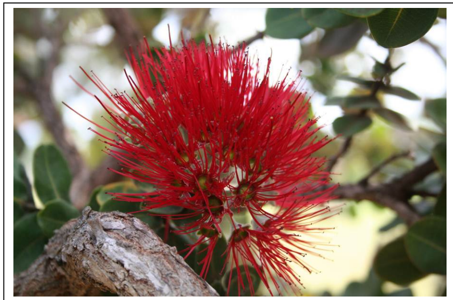
Figure 2. Blossom of the dryland lehua ( Metrosideros polymorpha ) (Photo No. KPAC2a_2102)

Ku'u pōki'i mai ke ehu makani o lalo Lulumi aku la i ke kai o Hilo-one No Hilo ke aloha Aloha wale ka lei e— My younger sibling who came from the place where the dusty wind rises from below Overtaken in the sea of Hilo-one The aloha is for Hilo Love for the lei